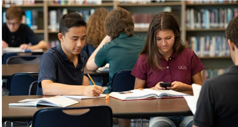
Figure 2. Student in Cumberland Ave Maryland 20815, Tennessee